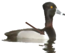
Ring-necked Duck Drakes with Redhead.

February 6 –Oradell, NJ – This is certainly one of my favorite “Winter” ducks. When you first look at the ring-necked duck, you think certainly, its name is a misnomer. It should be the ring-billed duck. But alas, hidden below a constricted neck, is a chestnut ring, not often seen. I saw about a dozen in at the Oradell Reservoir Dam on Friday and much to my delight, it was joined by a rare visitor to the Bergen County area, a Redhead (farthest duck on the right). Other duck-like birds included: Common Goldeneye, Bufflehead, Mallards, Canada Geese and Hooded Merganser. Add in a flyover by a bald eagle and Cooper’s Hawk...Good birding!