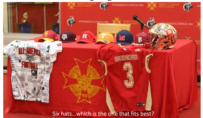
Six hats...which is the one that fits best?